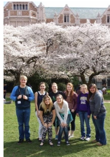
SWHS Students participate in 2015 University of Washington Math Day – funded in part by Foundation grants!

Thank you to all who faithfully support our organization through memberships and donations to the scholarship programs and classroom grants.