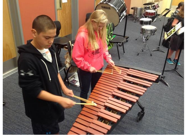
A xylophone for CMS through your Foundation donations!

The merged organization will continue to publish two newsletters per year and maintain a web site, blog, and Facebook page.